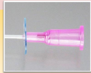
Soft and flat stabilizer

The soft stabilizer, the shaft side is flat and gently fits to the cat's body