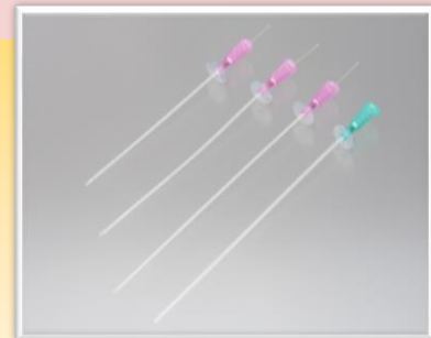
12types of lineup (Refer to size composition)

In addition to the conventional 120 mm, the lineup of 80 mm and 100 mm